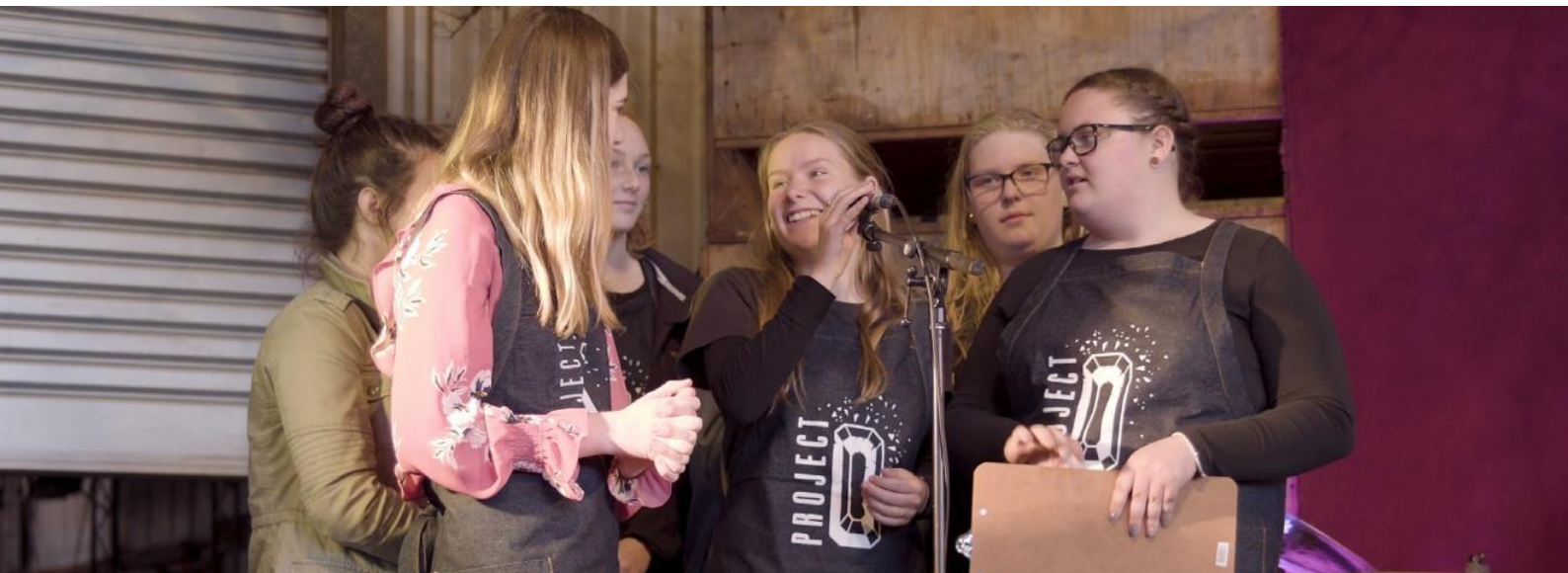
Image: Big hART's Project O at Stanley Dockside Festival, 2019

Tasmanian Ports Corporation (TasPorts) acknowledges the traditional owners of the land, sea and waterways on which we work. We pay our respects to Elders past and present, and to the Tasmanian Aboriginal community that continues to care for Country.