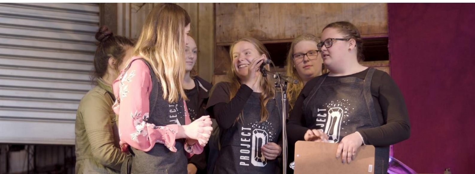
Image: Big hART's Project O at Stanley Dockside Festival, 2019

Tasmanian Ports Corporation (TasPorts) acknowledges the traditional owners of the land, sea and waterways on which we work. We pay our respects to Elders past and present, and to the Tasmanian Aboriginal community that continues to care for Country.