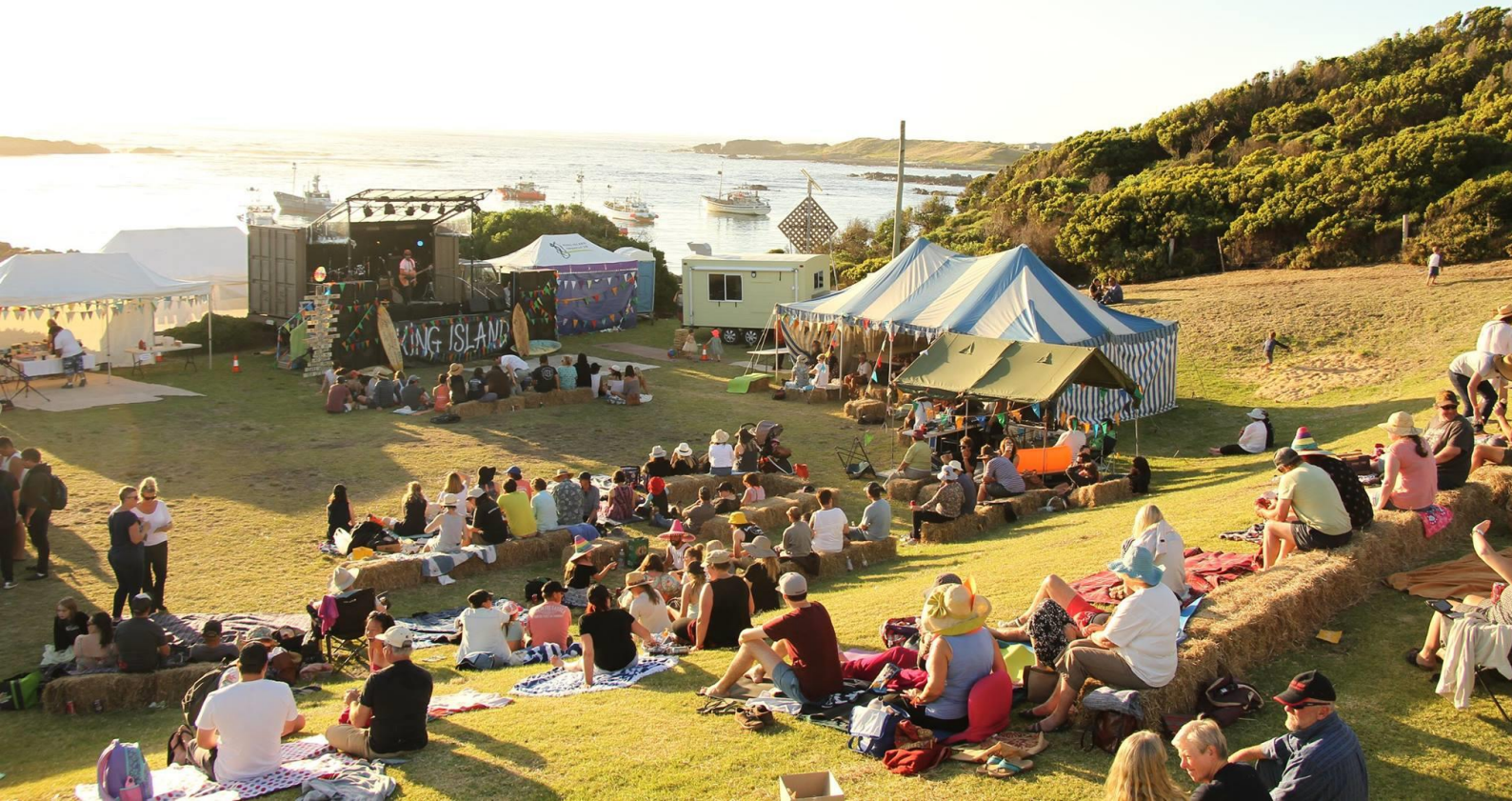
Image: Festival of King Island, 2018