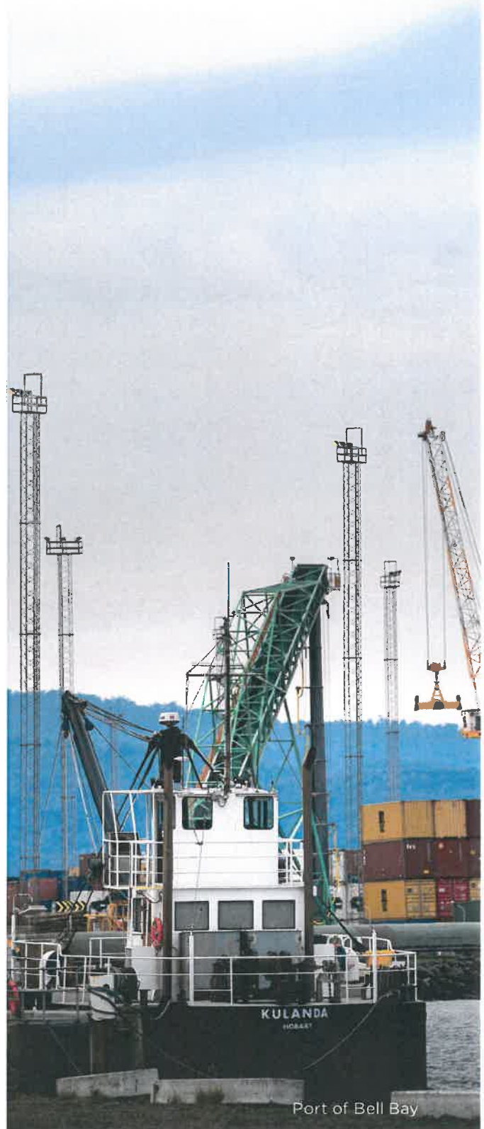
Port of Bell Bay

Training and conference expenses divided by head count.